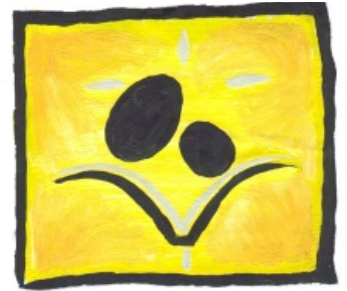
The logo for the Literacy program is a stylized picture of an adult and a child reading a book