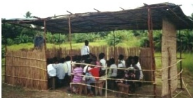
MozOutreach Preschool - 2001

Well, our first building blew down in a strong gust of wind.