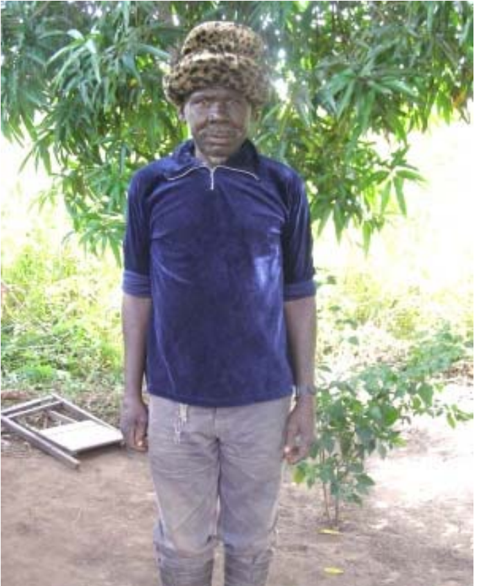
The Village Chief

All teachers sat in at the other teacher's classes at various stages to appreciate different teaching and classroom