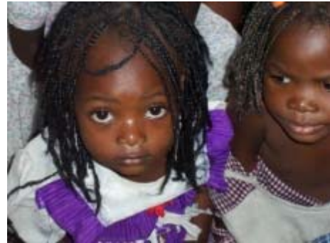
A little girl listens to the message of Jesus

We prayed together with the children; praised and worshiped the Lord; taught the Bible to the children; provided juice and bread and had a lot of fun.