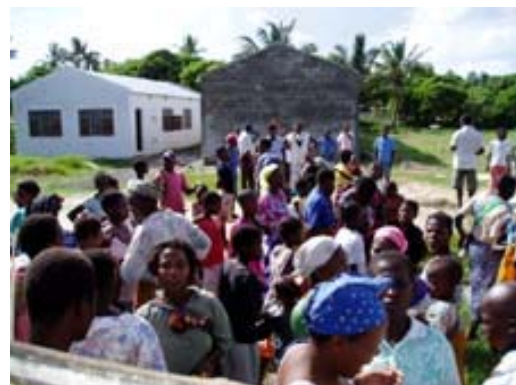
Opening day at the MozOutreach Primary School

to help the children into their first day of school.