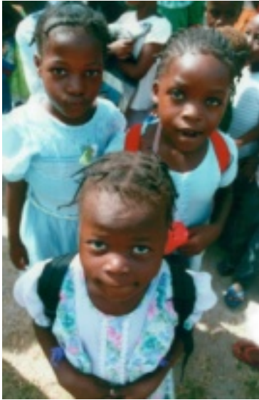
First day of school for 450 children

MozOutreach Primary School First Day 2004.