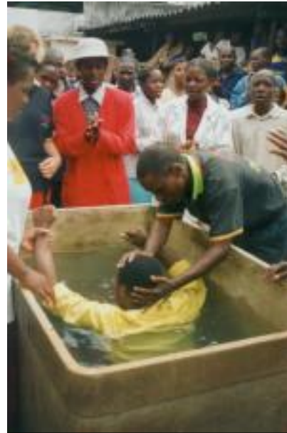
Ordinanca baptising inmates in prison

c e n t r a l prison in Beira city faithfully run by Ordinanca and to date has included two baptism services within the prison walls!