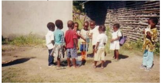
Children drinking from the new tap

School has been underway for over a month now. The water tap and the toilets are all now functional – (and everybody said, "Hallelujah" – especially the children).