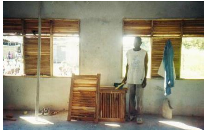
Our carpenter fitting the windows

The windows and doors are in and the three teachers and principal are kept working hard with the large number of children attending.