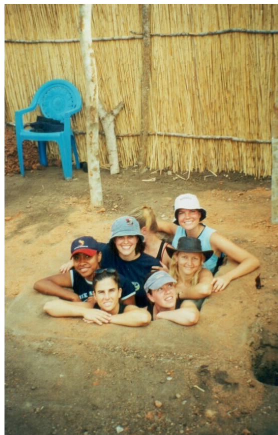
The famous pit latrine under construction

It is hilarious, because what we do here would be so different if done in the Western world. We just rock up to some village, all 15 of us crammed into one 3-seater truck, jump out, set up our speaker and just go for it! We dance, we sing and do our dramas, along with