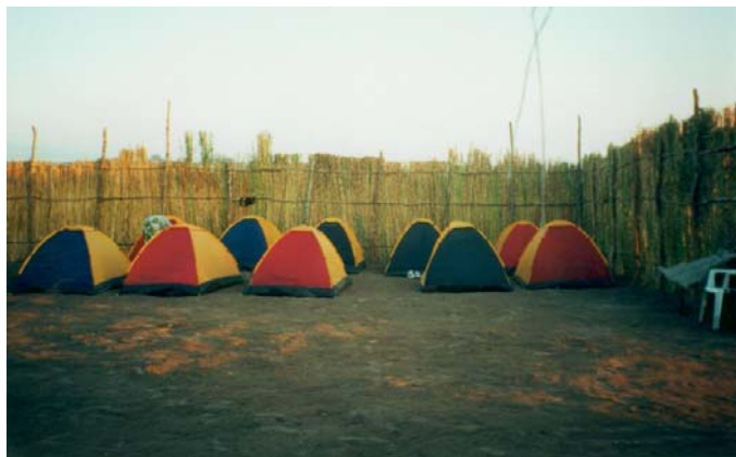
Tent city in Boane

"Well our time in Beira rocked. We did heaps of evangelism with open airs and the harvest is ripe let me tell ya! We saw over 200 salvations!