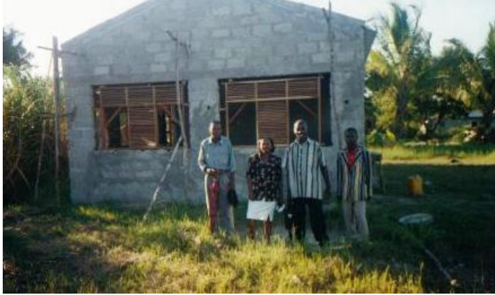
The Principal and teachers in front of the new classrooms

He said that Mozambique Outreach reach doesn't only identify the problem but helps to solve it – and as a result the school was built.