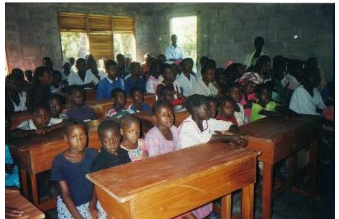
First day of school Note the number of children at a desk

Is there a possibility of another class to be run later in the day or another classroom to be built?