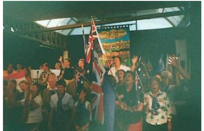
Aussies, New Zealanders and South Pacific Islanders at the prayer convocation in Jerusalem

The Convocation is organised through the “House of Prayer For All Nations” in Jerusalem. More than 640 people from over 130 different nations attended.