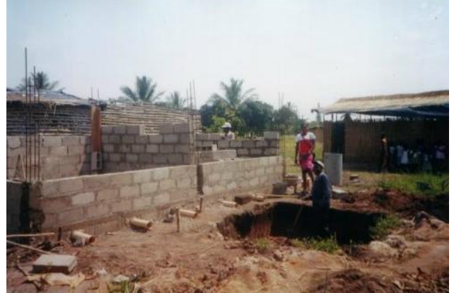
School toilet block under construction

Builders, plumbers, electricians, fencers and labourers have been swarming our Manga School property to complete the long awaited first classrooms and toilet block.