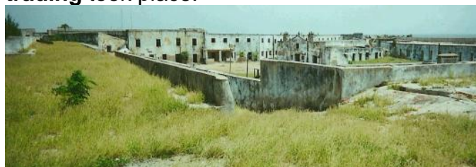
The fort at Ilha de Mocambique