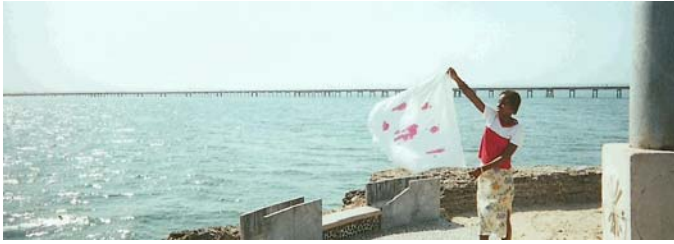
Nucha raising the flag symbolising righteousness

As I travelled through this area, my observation was that there is a very strong belief in witchcraft .