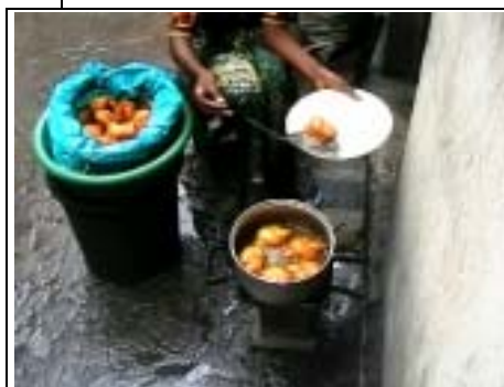
Piping hot and ready to eat