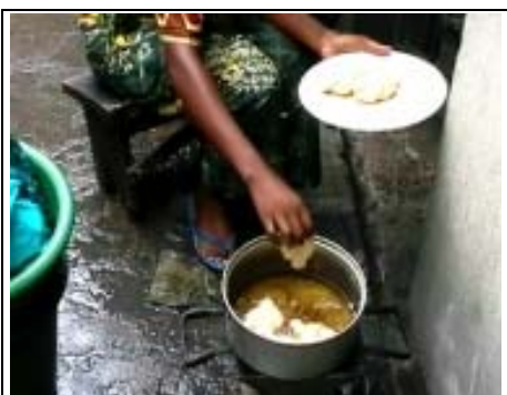
Cooking the scones

child to malaria, I don't think any of us expected the success she would have from the moment her first batch of scones were cooked.