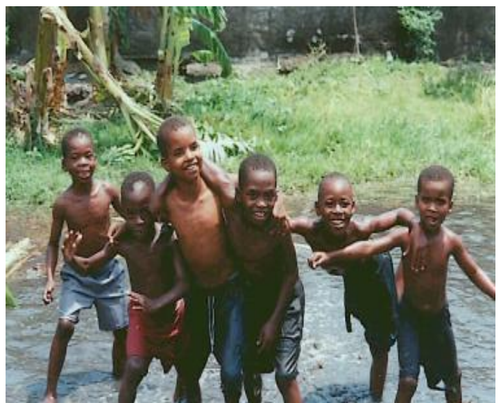
Young boys playing in the 'river' that had been a road