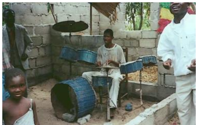
An innovative, home made drum kit

The one activity that impacted my life the most was our visit to the Beira prison. Not only did the men and women love God,