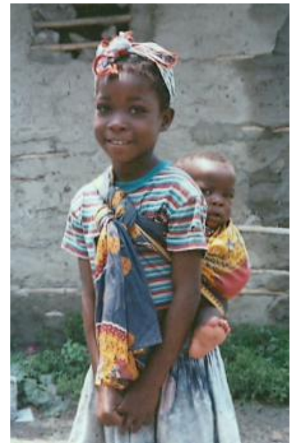
A young girl carries her baby brother

The Mozambican people also taught me how to dance and praise the Lord with energy and passion and, combined with the heat and humidity, it was quite normal to finish a time of praise and worship dripping with sweat.