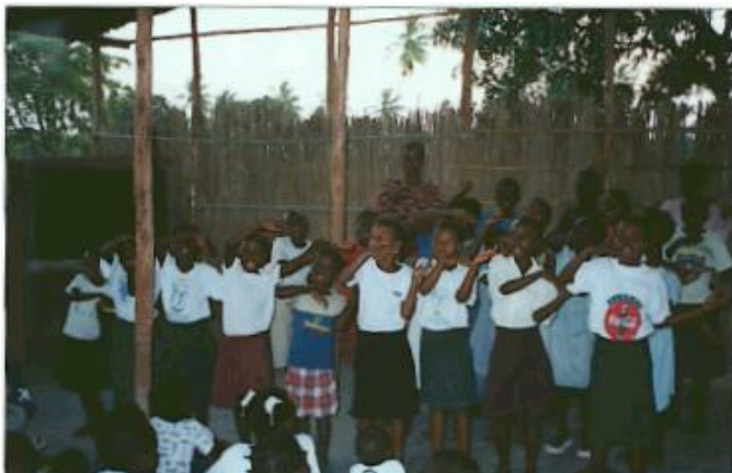
Children singing at the church celebration

Having previously travelled to different parts of the world on other short term mission trips, I was quite prepared for the typical sights, sounds and smells of a city in a third world country. Beira lived up to my expectations with its dusty and busy markets, overloaded sharpas (mini buses), unique smells in the main town and outer lying villages, streets littered with potholes, bumps and hollows and sometimes two generations of a family living in a small, three roomed house.