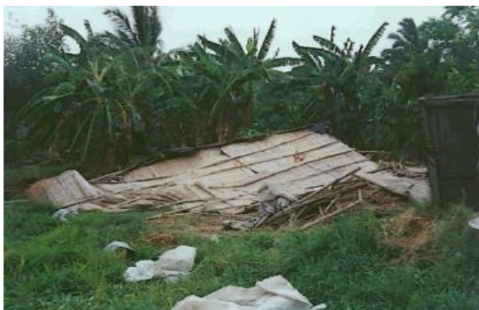
Massamba church after the mini cyclone