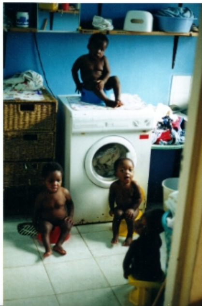
Potty Brigade – Toddler's house