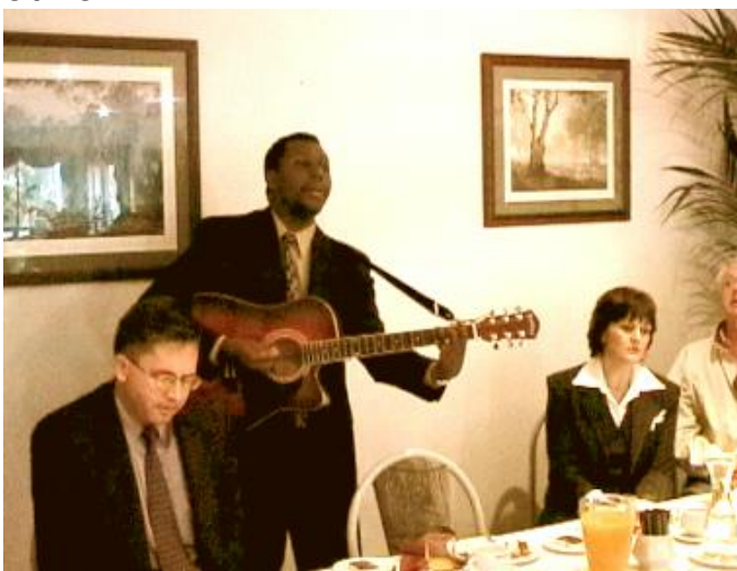
Playing at Business breakfast – Logan City

In addition he sang and spoke to a lively business group in Logan City about fulfilling the Lord's plan, before we fulfil our own.