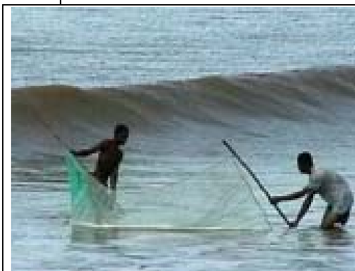
One fishing net business gets 15 people out of poverty

On my trip in November, we plan to start 3 new businesses in Beira.