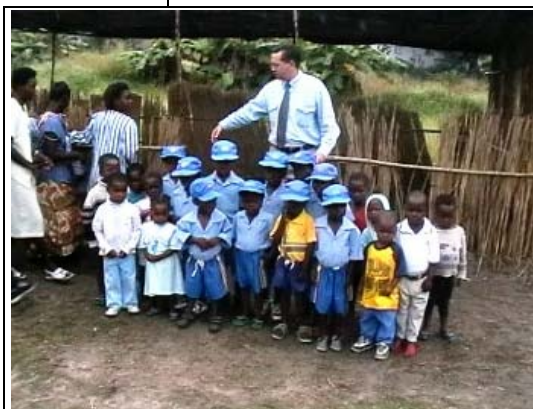
Pre -school children with their new uniforms

We have begun our new education project and will begin construction on our new classrooms for pre-school and grades 1-3 in November.