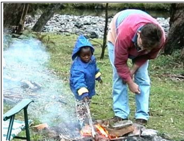
First Camping Trip - With Dad making a fire

a bit now. The birth (albeit spiritual) has happened and our joy is full. Thanks Lord