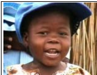
One of our pre-school children in her new uniform